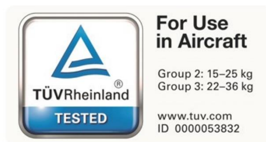
Attestation that the car seat is approved for use in aircraft