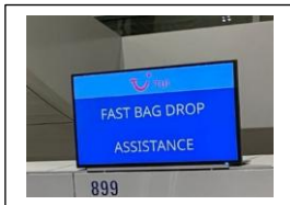
Fast Bag Drop Assistance Counter 899