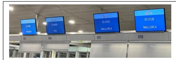
Normal Check-in counter