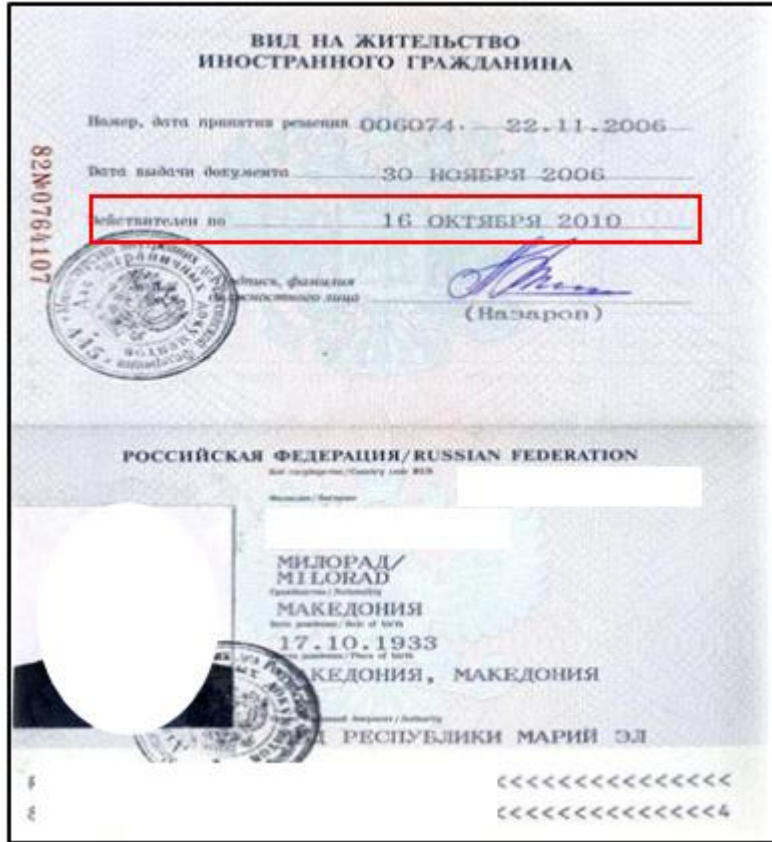
Süreli Oturum Örneği