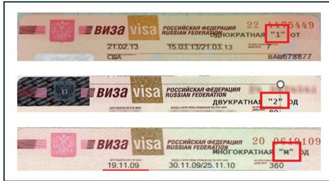
Single, double and multiple entry visa sample